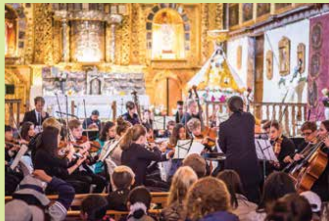
BELOW, a Youth Orchestra ensemble performs at the Church of San Juan Bautista of Huaró. You can view additional photos and read more about the tour on the official tour blog at wysoperutour.wordpress.com .