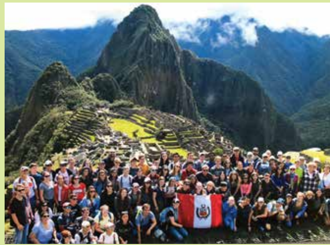
ABOVE, Members of Youth Orchestra and their chaperones pose for a group photo during their tour of Machu Picchu in July.

Did you go on an international trip with WYSO? Send your photos to wyso@wysomusic.org for inclusion in our next newsletter!